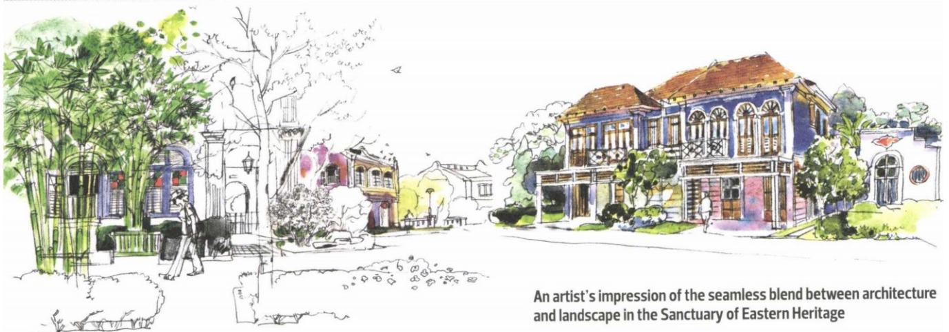
An artist's impression of the seamless blend between architecture and landscape in the Sanctuary of Eastern Heritage

As the country got its start by exporting natural rubber, the Heritage Gardens consists of sculptures and fountains celebrating Malaysian history and legacy, standing amid rubber trees. Other shrubs and trees native to the site were also transplanted to enhance the look and feel of this communal area.